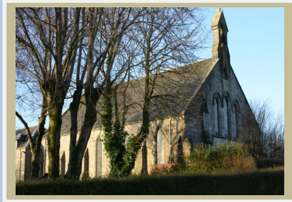
Our Church since 1889