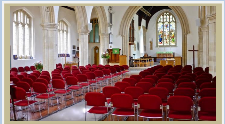
Example of the new seating